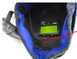
Air Duct feeding the clean air into the breathing zone