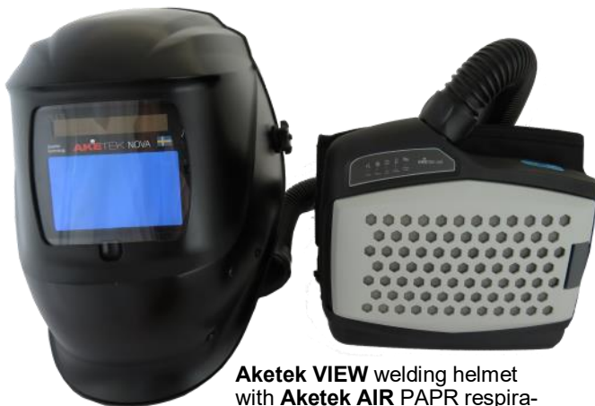
Aketek VIEW welding helmet with Aketek AIR PAPER respira- tor system